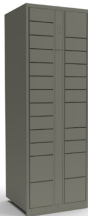
23 Box Tower