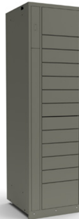
13 Box Tower