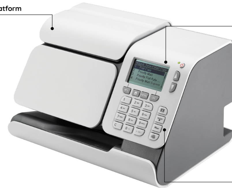
3. Shortcut Keys